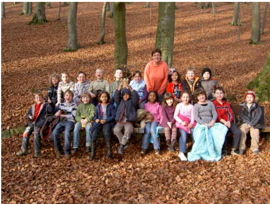
Enjoying the last days of autumn in the woods!