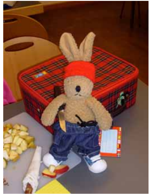
A succulent juice from regional products.