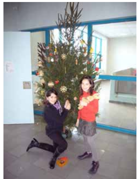
Christmas is near !