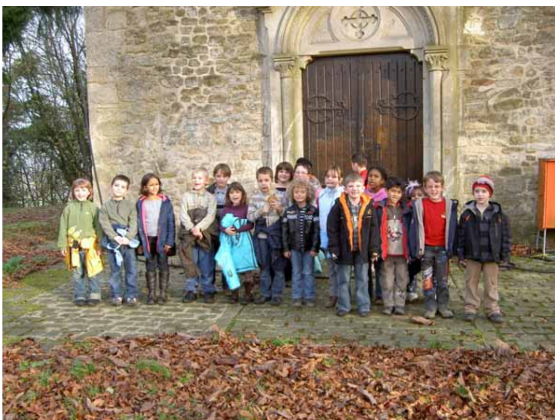
After an exhausting ascent, we took a little rest in front of the chapel on St John's Hill.